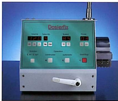
Display with controls