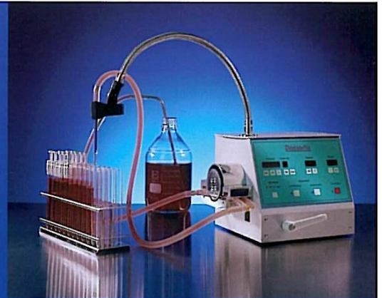
Multifunction pump in action